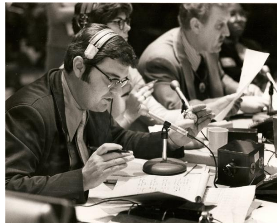
Dad Radio small