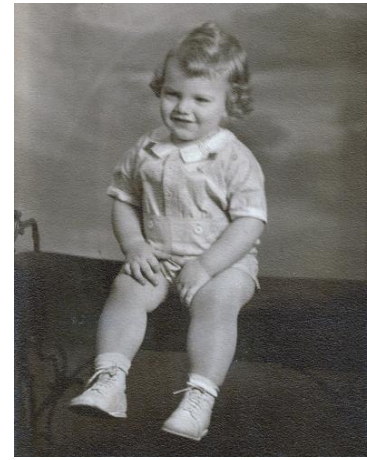
Dad 1 Year small